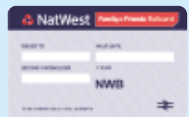
NatWest Bank Family & Friends Railcard 1-Year (RSP 4599/319)

Young Persons / 16-25 Railcards without photos will need to be presented together with either a valid Young Persons / 16-25 Photocard or a Permit to Travel Without Photocard (as shown above).