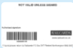
(reverse of online cards)