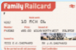
Family Railcard (RSP No. (APTIS) 4599/253 (SWECOIN) 7599/253)