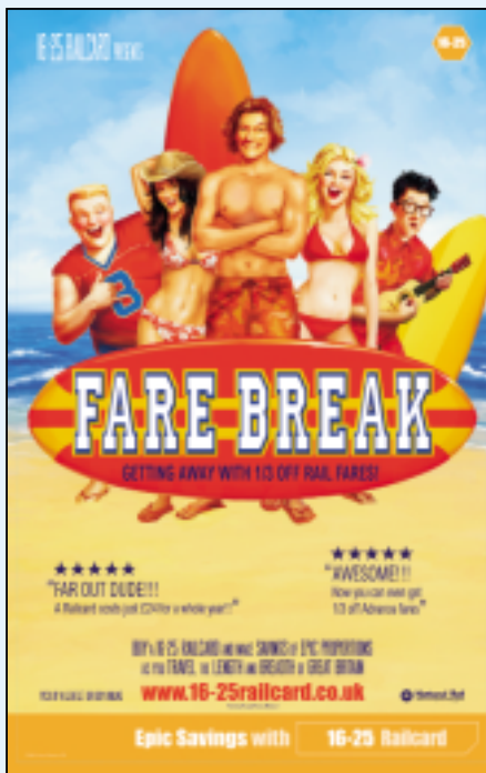
YP08B/P – Valid from 18 May 2008 to 6 September 2008