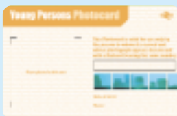
Young Persons Photocard RSP No. 3588/16 (APTIS)