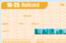
16-25 Railcard (RSP 7599/217)