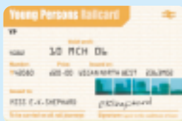
Young Persons Railcard (RSP No. (APTIS) 4599/217 (SWECOIN) 7599/217)