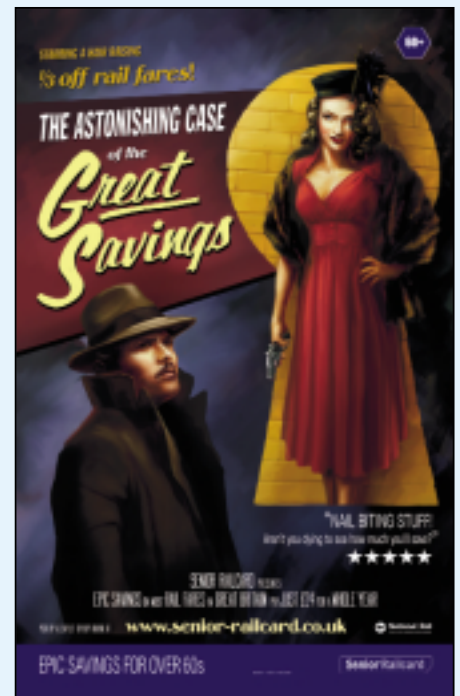
SN08A/P – Valid from 02 January 2008 to 17 May 2008