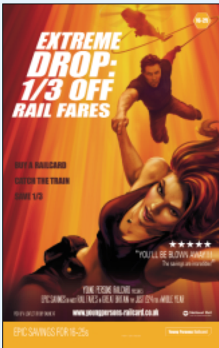
YP08A/P – Valid from 02 January 2008 to 17 May 2008