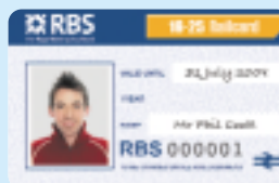
RBS Bank 16-25 Railcard 1-Year (RSP 4599/320)