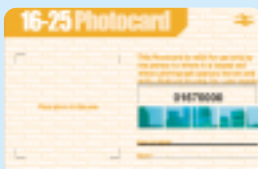
16-25 Photocard (RSP No. 3588/16A)