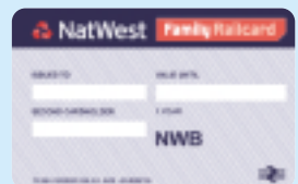
NatWest Bank Family Railcard 1-Year (RSP 4599/319)