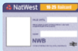
NatWest Bank 16-25 Railcard 5-Year (RSP 4599/294)