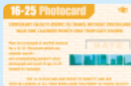
16-25 Photocard 'Permit to Travel' (RSP No. 3588/17)