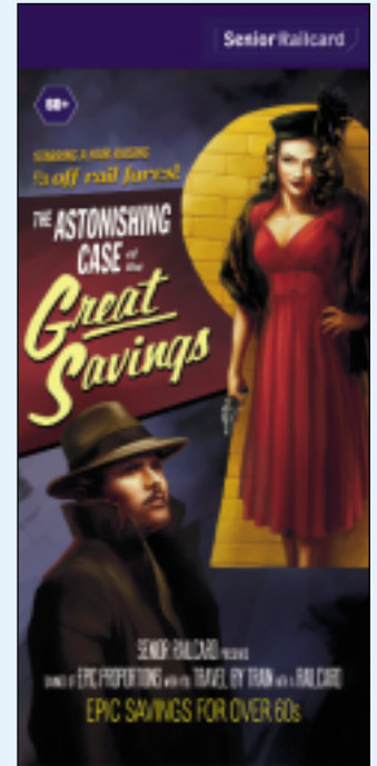
SN08A – Valid from 02 January 2008 to 17 May 2008