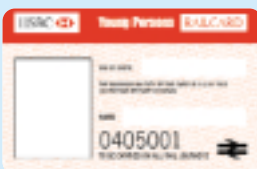
HSBC Bank 4-Year Railcard (RSP 24881/18)