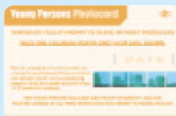
Young Persons 'Permit to Travel' RSP No. 3588/17 (APTIS)