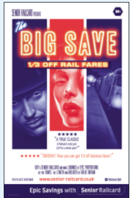
SN08B/P – Valid from 18 May 2008 to 6 September 2008