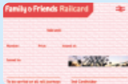
Family & Friends Railcard (RSP No. 7599/253)