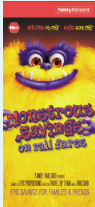
FR08A – Valid from 02 January 2008 to 17 May 2008