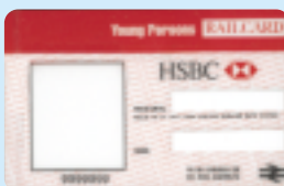
HSBC Bank 4-Year Railcard (RSP 24881)