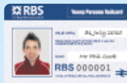
RBS Bank Young Persons Railcard 3-Year (RSP 0599/294)