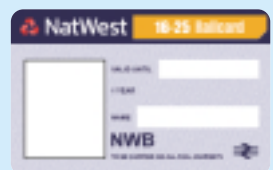
NatWest Bank 16-25 Railcard 1-Year (RSP 4599/318)