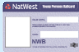
NatWest Bank Young Persons Railcard 5-Year (RSP 4599/294)