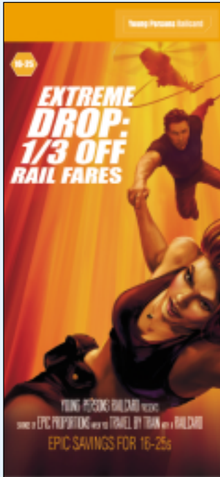
YP08A – Valid from 02 January 2008 to 17 May 2008