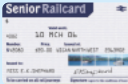
Senior Railcard (RSP No. (APTIS) 4599/197 (SWECOIN) 7599/197)

These are the current and valid Railcard designs, which may all be used to purchase Railcard discounted tickets. Railcards that are sold by Travel Agents or issued by ATOC may be slightly different in appearance, but should always be treated in exactly the same way. If you need additional valid Railcard stock, then simply order using instructions on the previous page.