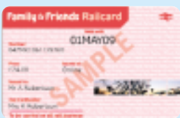
Family & Friends Railcard