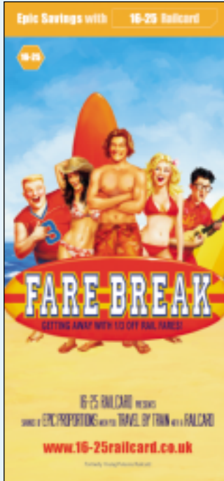
YP08B – Valid from 18 May 2008 to 6 September 2008