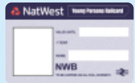
NatWest Bank Young Persons Railcard 1-Year (RSP 4599/318)