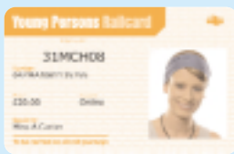
Young Persons Railcard