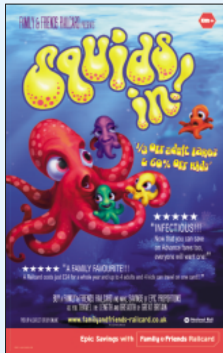
FR08B/P – Valid from 18 May 2008 to 6 September 2008