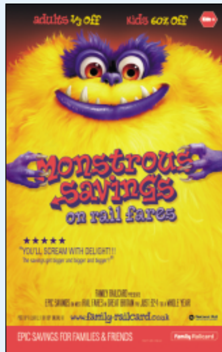
FR08A/P – Valid from 02 January 2008 to 17 May 2008